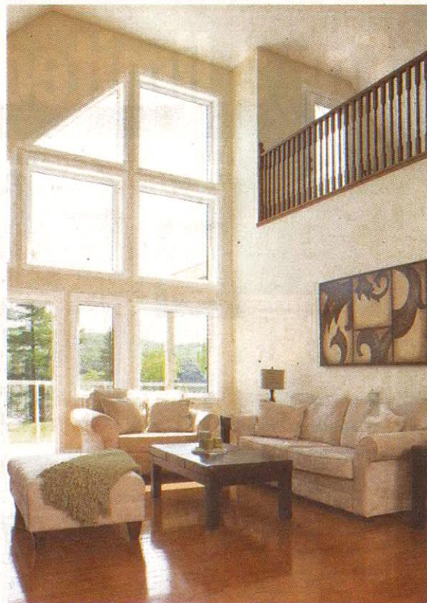
Offering detached bungalows with cathedral ceilings, loft areas and energy efficient heating and cooling systems, Silver Beach combines the rugged Canadian Shield landscape with the modern cottage experience.

Adding to the community's resort-like feel, Kowalski also plans to build a 5,000 square-foot clubhouse featuring an elevated deck, kitchen, bar, outdoor barbecue area and grand hall, along with an exercise facility, games room, sauna and health and wellness area. And if residents do feel like roughing it every now and then, the city's only a two-hour drive away, he says.