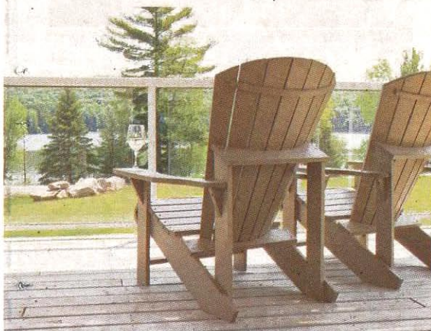
Located on the Kashagawigamog lakefront, Silver Beach features a beach with a 200 ft. walkout sandbar and 30 boat slips.